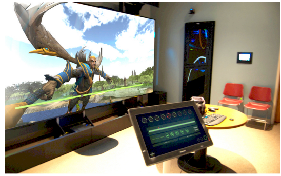
Figure 7: Bardic running on a 21' display using multi-screen table-top touch screen controllers. The image shows a generated cinematic for the DOTA 2 domain.

Our subset selection UI allows the user to select an interesting part of the game in order both to show only relevant information and to keep computation times reasonable. In its