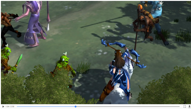
Figure 5: An automatically generated over-the-shoulder shot of Mirana.