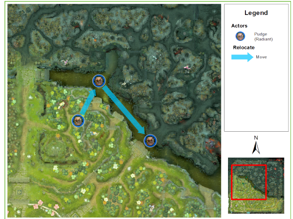
Figure 4: An example showing an automatically generated map. In this map, the movement of the character Pudge is shown along two distinct paths.

trope to convey a character attempting to achieve some goal and ultimately failing.