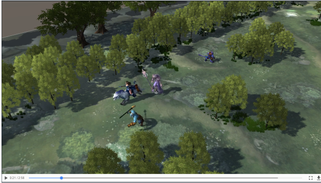
Figure 6: An automatically generated crane shot of three characters moving along a row of trees.

stance when a move involves only one character, a shot in which the camera moves along with that character is used.