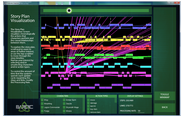
Figure 3: Bardic's visualization of a generated story structure based on DOTA 2 log data. Rectangles in the diagram indicate actions, lines between actions indicate causal or temporal constraints and color is used to indicate sub-plans performed by distinct characters.

Story Visualization Viewing the underlying structure of actions, particularly how action types are distributed temporally and across actors, can yield insights into what is hap-