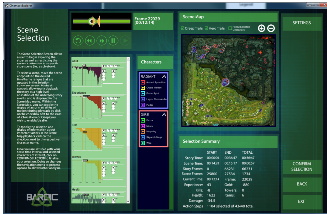
Figure 2: Bardic's subset selection screen is used to constrain the game log content for which narrative reports are generated. The tool allows users to scrub through game activity over time, to view graphical characterization of game state variables and to restrict narrative generation to sub-stories by time and player participants.

The first screen presented to a user after loading an Impulse file is the subset selection screen as seen in Figure 2. This screen shows how the game progresses over time. It contains static graphs that visualize key statistics over the course of the game as well as an animated map that displays the location of every character. The user can play back, pause, and scrub through time to see where the characters are, and use this information to select an interval of interest. The user can also restrict the characters that should be included in the selected subset by using the checkboxes. Once a user has selected a time interval and a set of characters, they can confirm the selection and all subsequent actions will only use the selected sub-story.